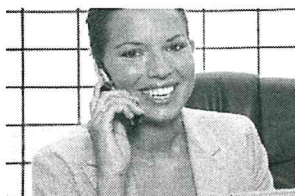
Over the Phone

Our customer service representatives are here to help. Whether to ask a question or to place a new order, give us a call at: 1-800-441-4122